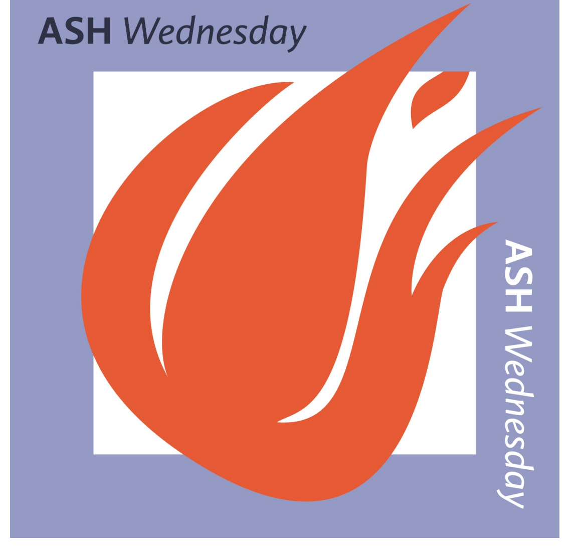
Ash Wednesday, Feb. 14, 2024