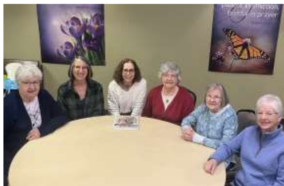
Those who "showed up" March 21!

"So let us not grow weary in doing what is right, ... so then, whenever we have an opportunity, let us work for the good of all, and especially for those of the family of faith." (Galatians 6: 9-10)